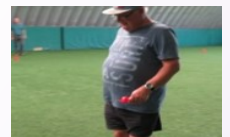
Egg & Spoon

Our outdoor survival day in June was a huge success and our attendees asked for another, so we arranged one for 11th July. We worked as a team and pitched the tent, Set up