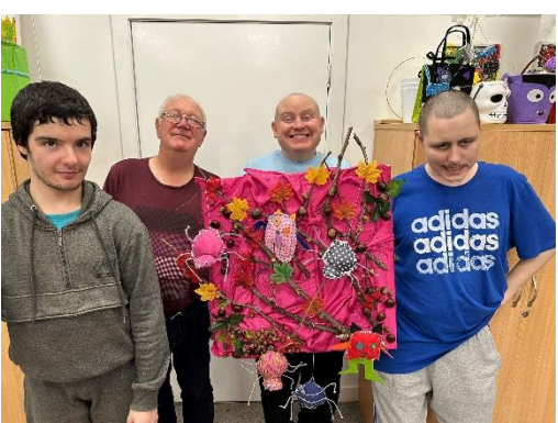
Fabulous, frightening florals had also been created by our floristry group and they made the base appear spooktacular as Halloween approached.