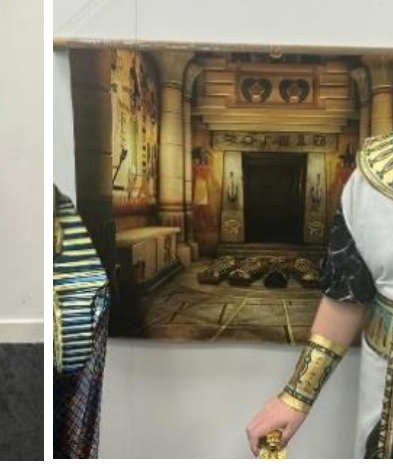
Page 4 of 10